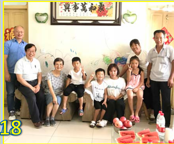
2018年 病人、家人和天鄰義工合照。 Pictures with family and HIS worker