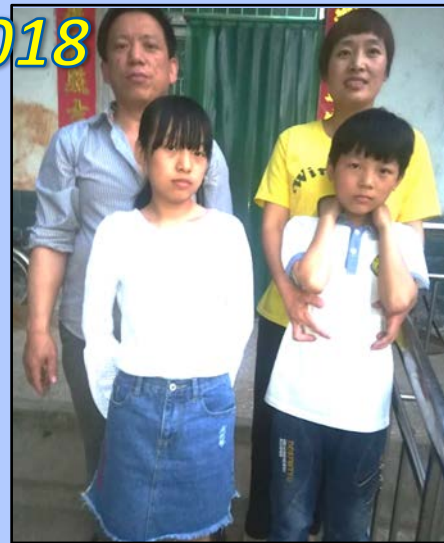
病人的家庭照 Family photo