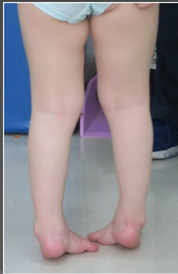
先天內翻馬蹄 Bilateral congenital clubfoot