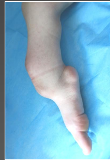
先天性腓骨不全 Fibula hemelia