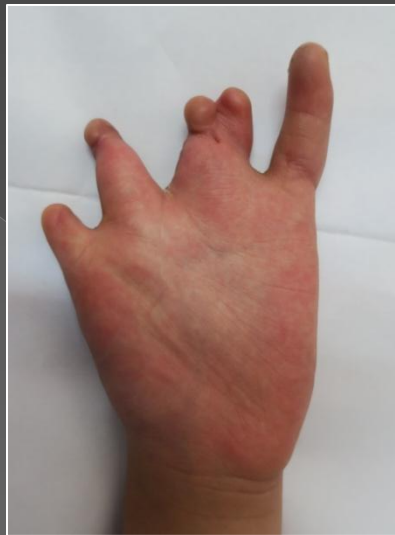
併指 Syndactyly of fingers