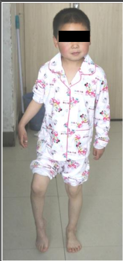
腦癱，右偏癱 Cerebral palsy, right hemiplegic type