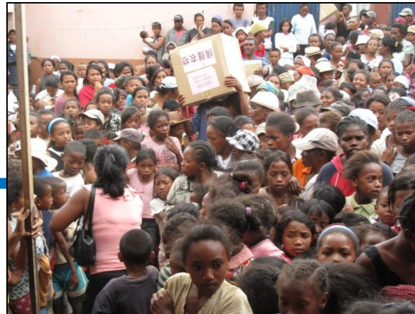
等候禮物之孩童 Children waiting for presents